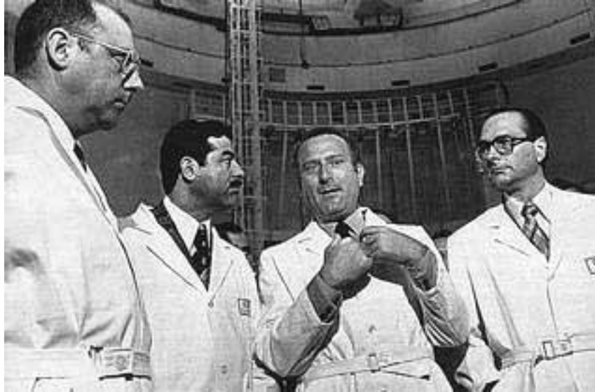
Figure 1. Saddam Hussein and Jacques Chirac in Nuclear laboratory