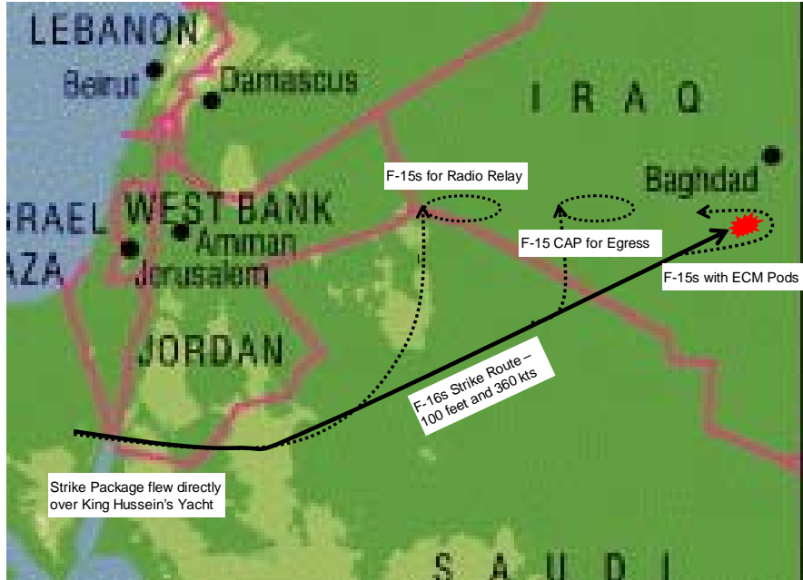
Figure 2. God's Eye View of the Strike

The level of professionalism displayed by each member of the strike team reinforced the reputation of the IAF. The ingress to the target lasted one hour and thirty-three minutes. The aircraft flew in a relatively close formation at approximately 360 knots and 100 feet above the desert floor. No radio calls or radar emissions, which could tip enemy outposts to the coming attack, came from the formation of F-15s and F-16s. At the briefed locations, the F-15s split into two-ship formations, turned on their radars and climbed to cover the F-16s. Approaching the initial point, where the F-16s would make final preparations to strike the target, the final two F-15s climbed away from the strike formation and turned on their radars and external electronic counter-measure pods. These aircraft served the dual purpose of protecting the F-16s from hostile aircraft as well as hostile search radars. 54 Shortly thereafter, the F-16s spread their formation out for