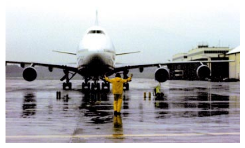
The Civil Reserve Air Fleet augments airlift capabilities with US civil aircraft, aircrews, and support structure.

There are three stages of CRAF activation designed to meet varying levels of defense airlift needs. USCINCTRANS may activate Stages I and II with the approval of the Secretary of Defense. The Secretary of Defense will issue the order to activate Stage III. The CRAF is activated in order to use commercial airlift assets to augment DOD's military airlift capability.