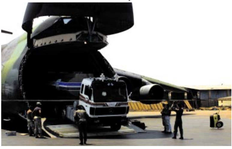
Airland is the most frequently used delivery method, permitting delivery of larger loads with less risk of cargo loss or damage.

The selection of appropriate tactics for an airlift mission may be influenced by user requirements, destination characteristics,