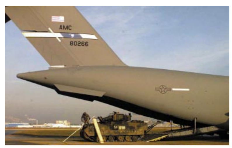
The Army, with an abundance of outsize and oversize cargo, has the largest requirement for common-user aircraft.

a. The Army. Even though the Army has significant organic airlift assets, it still has the largest requirement for common-user airlift . In particular, Army light infantry, airborne, and air assault forces rely heavily on airlift for deployment, sustainment, employment, and redeployment. Once in the theater, light infantry and airborne forces continue to rely heavily on airlift. Air assault forces, on the other hand, due to their organic