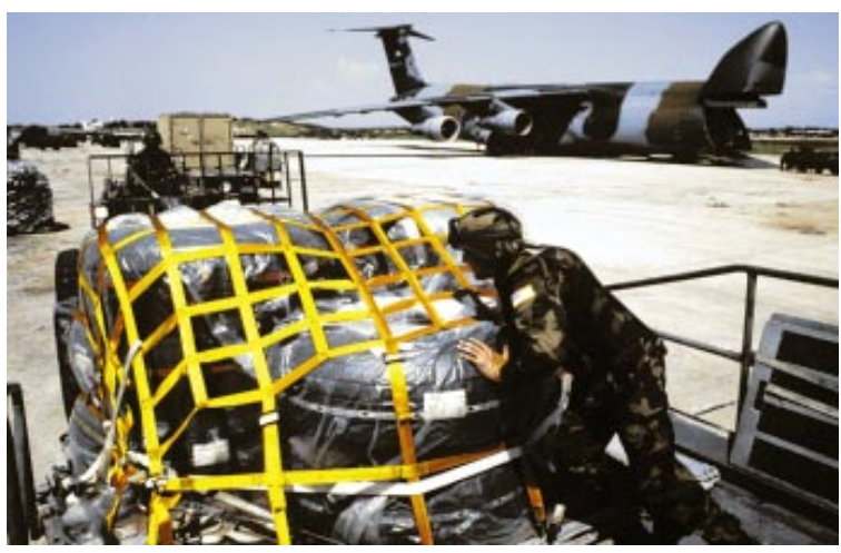
Successful airlift operations depend on numerous interdependent functions, not the least of which is the air terminal.