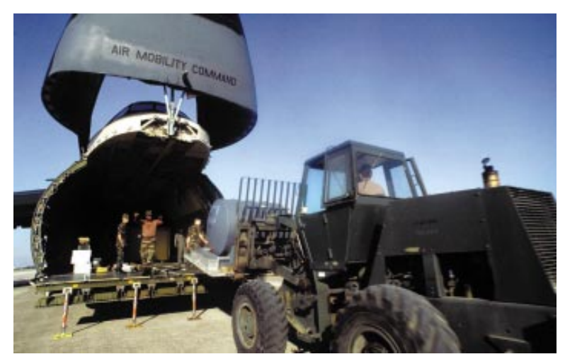
Efficient airlift operations are highly dependent on ground handling equipment and personnel.

• Supported Combatant Commander Responsibilities. The supported