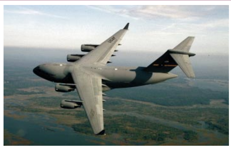
As a common-user force, a wide variety of aircraft capability will be available to all authorized users.

b. Aerial delivery includes all methods of delivering personnel, equipment, and supplies from an airborne aircraft. This enables commanders to project combat power into areas lacking suitable or secure airfields. Aerial delivery gives commanders the ability to capitalize on the element of surprise because of the speed of delivery and the vast number of potential objective areas where forces can be employed. However, the additional weight and space required for parachute rigging and cushioning material reduces the amount each aircraft can deliver.