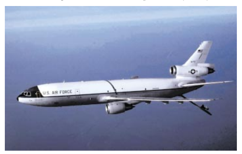
The Transportation Component Command, Air Mobility Command provides not only airlift but also aerial refueling forces for worldwide support of US and allied armed forces.

war. USTRANSCOM is organized into three Transportation Component Commands (TCC) — the Military Sealift Command (MSC), Military Traffic Management Command (MTMC), and AMC. MSC is the operating agency for ocean and maritime services. MTMC is the operating agency for common-user land transportation, water terminal operations, and CONUS traffic management. AMC is the operating agency for air mobility (airlift and aerial refueling).