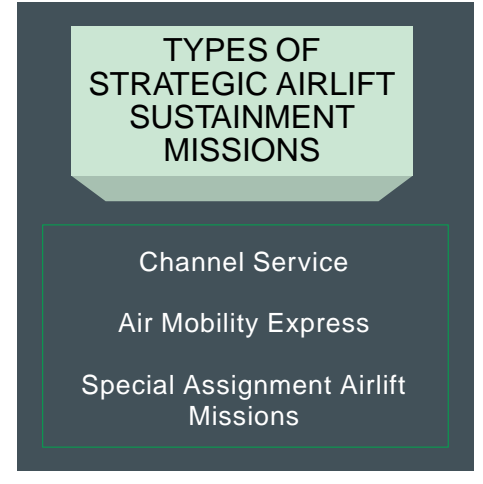
Figure II-2. Types of Strategic Airlift Sustainment Missions

b. Sustainment. Strategic airlift sustainment involves the movement of replacement supplies, equipment, personnel, and units. USTRANSCOM supports sustainment operations through the types of missions listed in Figure II-2.