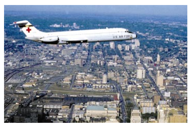
Aeromedical evacuation forces provide patient movement not only between international locations and CONUS, but also to and from locations within CONUS.

a. Mission of AE. AE encompasses movement from the point of distress to the initial medical treatment facility and all ensuing levels of medical care. USCINCTRANS is the DOD manager for intertheater AE and global medical regulating. Information on the AE mission, Service component, and common-user systems, organizations, and command and control procedures is contained in Joint Pub 4-02, "Doctrine for Health Service Support in Joint Operations" and Joint Pub