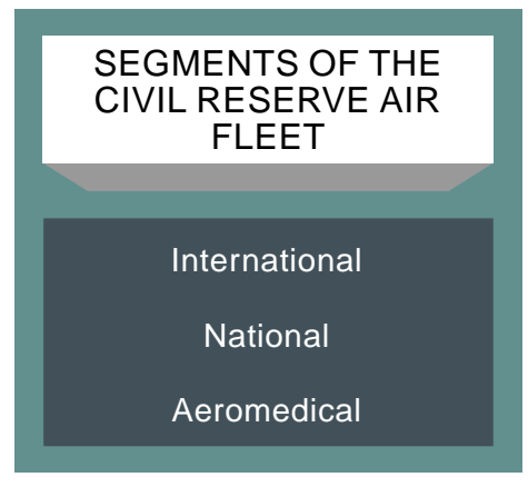
Figure II-3. Segments of the Civil Reserve Air Fleet