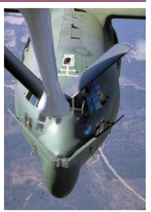
This MC-130, equipped with the Fulton Recovery System, extends its on-station time through aerial refueling operations.

the activities of the mechanisms are supported or directed by US or allied personnel. Other mechanisms or groups operating independently may also determine it is in their own interest to assist evaders. The potential of these organizations to assist E&R operations should not be ignored and should be exploited whenever possible. (a) Value of UARMs. UARMs are valuable assets because they can support and supplement both conventional and unconventional recovery operations. Their potential value should always be considered and, if possible, incorporated into recovery planning. With proper support, UARMs can be established in almost any environment. (b) Establishment of UARMs in Advance of Operations. UARMs should be created and maintained in advance of their potential need. The process of establishing viable UARMs is a long and hazardous one. No amount of last-minute