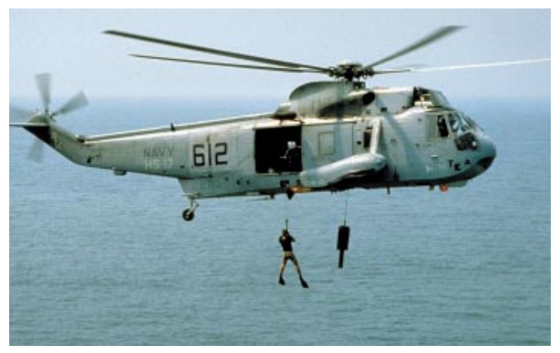
Conducting recovery operations from the SH-3 Sea King helicopter.

b. Unconventional Recovery Operations. These operations differ from conventional recovery operations in that they use specially trained and/or indigenous forces and