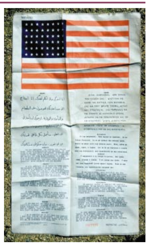
The blood chit, written in several languages, promises a reward for assisting US evaders.