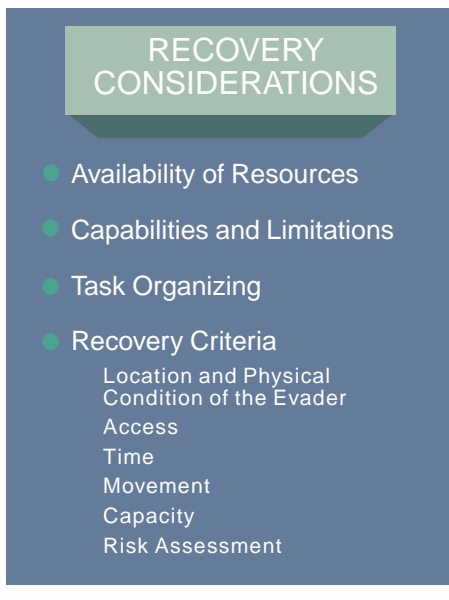
Figure III-2. Recovery Considerations

if the recovery site is in enemy territory (or in friendly territory occupied by the enemy), we should still consider the spatial relationships of the site with respect to bordering friendly and neutral territory. For example, selecting a site in enemy territory might be pointless if a bordering territory refuses to grant overflight of its territory.