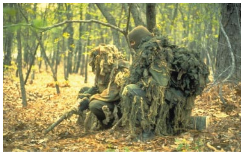
SOF forces, shown here in sniper suits, maintain the capability to conduct SAR and CSAR operations to assist evading personnel.

or limit enemy activity in the group's base camp areas. For these reasons, evaders do not pose as great a security threat to guerrilla groups as they do to SOF teams. In addition, there may be less of a requirement to quickly exfiltrate evaders from these groups. There are two types of guerrilla groups-sponsored and unsponsored. (1) Sponsored Guerrilla Groups. Sponsored guerrilla groups may be supported, led, or advised by US or allied special forces elements. They may be recruited and trained by friendly forces or they may be dependent on allied countries. Because exfiltration of personnel and materiel may be a routine operation for these groups, evaders may be more expeditiously returned to friendly territory through their assistance. Planners should ensure guerrilla groups can use the communications, contact. and authentication procedures which have been established for the theater of operations. Evaders who find themselves under the control of such guerrilla groups should comply with all reasonable instructions issued by the group. (2) Unsponsored Guerrilla