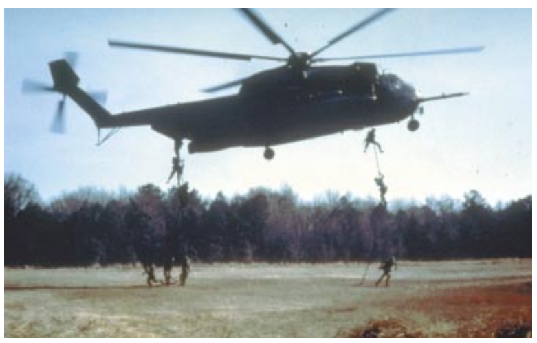
Fastroping from the HH-53 helicopter.

command interest or sudden infusion of resources can expedite the process without seriously jeopardizing the security of the mechanism. Constant support of UARMs at certain minimal levels is ultimately more successful and less expensive than sudden, sporadic support. Combatant commands that do not take steps to establish UARMs before recovery operations are required, i.e., before initiation of hostilities, will be forced into sole dependence on conventional and other unconventional recovery assets. When possible, efforts should be made to establish UARMs prior to the start of hostilities in all regions where military operations may occur. (c) Special Procedures for UARMs. Successful UARM operations require special procedures. UARM operations cannot be conducted under the same principles as conventional military operations. When planning UARM operations, all security, communications, intelligence, diplomatic, command, supply, transportation, fiscal, and legal procedures should be consistent with the goals of returning evaders to friendly control while ensuring the continued survival of the UARM. (d) Evaders' Conduct in an UARM. While in an