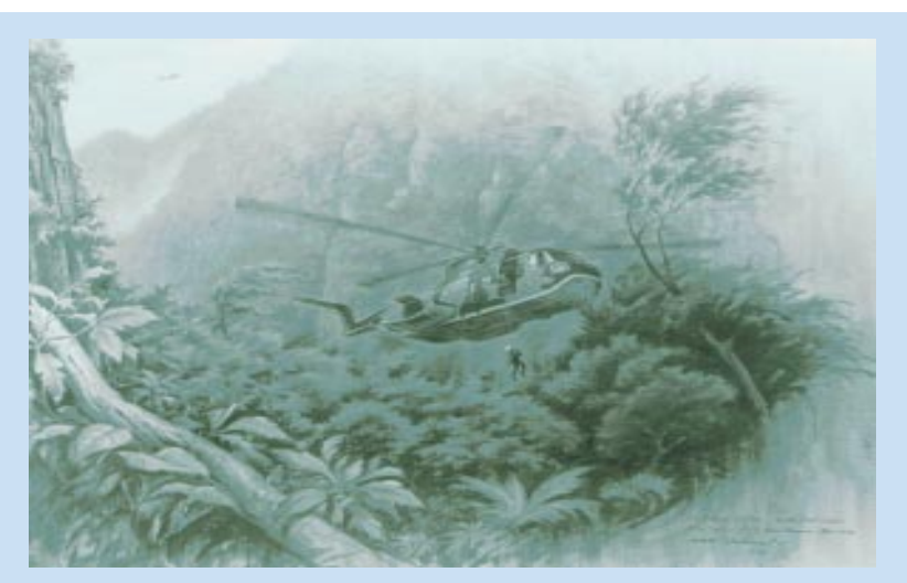
Waiting for a Jolly Green Artist, Walt Green - USAF Art Collection

In Viet Nam - The rescue of a downed US Air Force pilot by a Sikorsky HH-3E (c. 1968-1970)