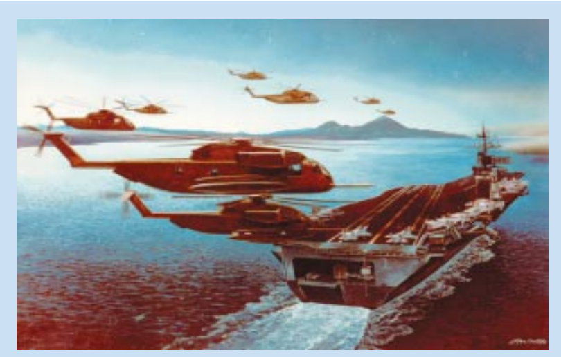
The Iranian Hostage Rescue Mission Begins — April 24, 1980 Artist, Ren Wicks - USAF Art Collection #69.80.

The JFC normally designates the Joint Search and Rescue Center (JSRC) as the organization responsible for integrating all operations which support and recover isolated personnel. The JSRC normally validates and approves E&R operations concepts developed by the components, then monitors the implementation of those concepts. Once the component has implemented an E&R operational concept, the JSRC monitors its status and implements the best option to support and recover isolated personnel. The following paragraphs